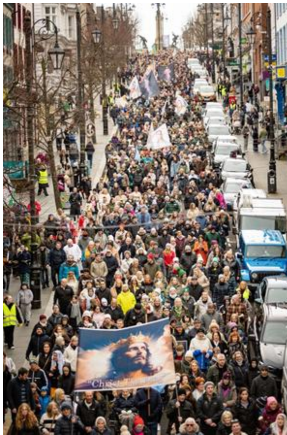
Eucharistic procession in Derry - February 1st, 2025